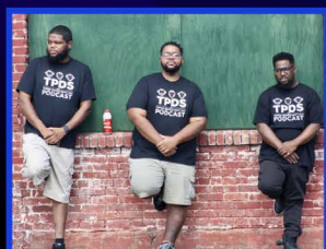
THINGS PEOPLE DON'T SAY @TPDSPodcast