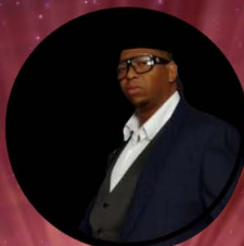
NAPALM THE BOMB @NAPALMTHEBOMB