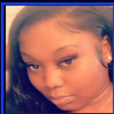
KÉ STRONG @KE_STRONG