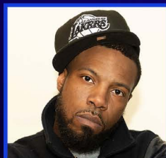
CORTNEY KENTRELL @CORTNEY_KENTRELL