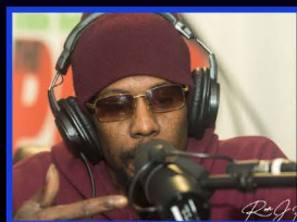
KELO C @KELOC007