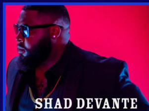
SHAD DEVANTE @SHADDEVANTE