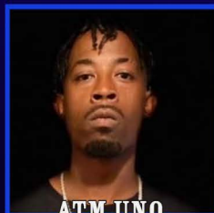
ATM UNO @OFFICIALATMUNO